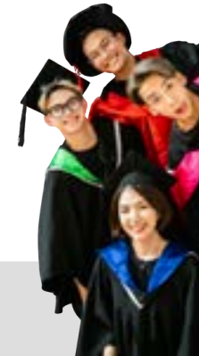
RMIT Vietnam celebrates the largest-ever group of graduates in 2024