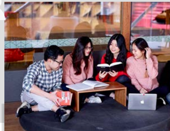
RMIT Global Leader Experience