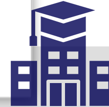
Future Founders Competition