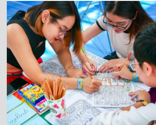
2024 Accessibility Design Competition "A world that works for all"